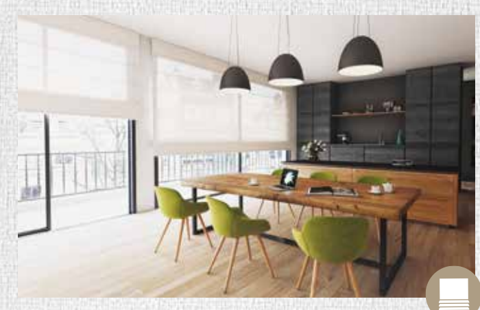
MHZ Roman blinds