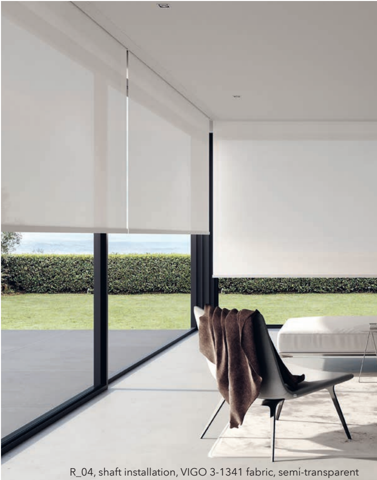
R_04, shaft installation, VIGO 3-1341 fabric, semi-transparent