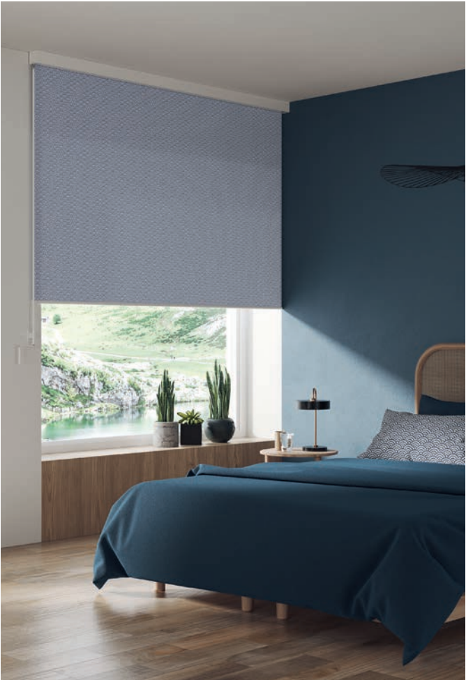
R_03 cassette, HARO 2-2545 fabric