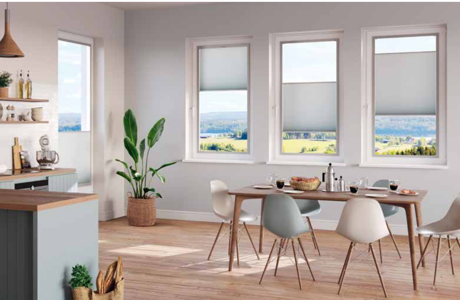
Honeycomb blind 11-5222, freely movable, MALA fabric, RAL 7040

Energy-efficient properties, a modern look and excellent blackout performance make DUETTE® honeycomb blinds a popular window covering. Combined with the magnetic frame, you have an easy-to-install privacy and sun protection system that blends in stylishly with your home.