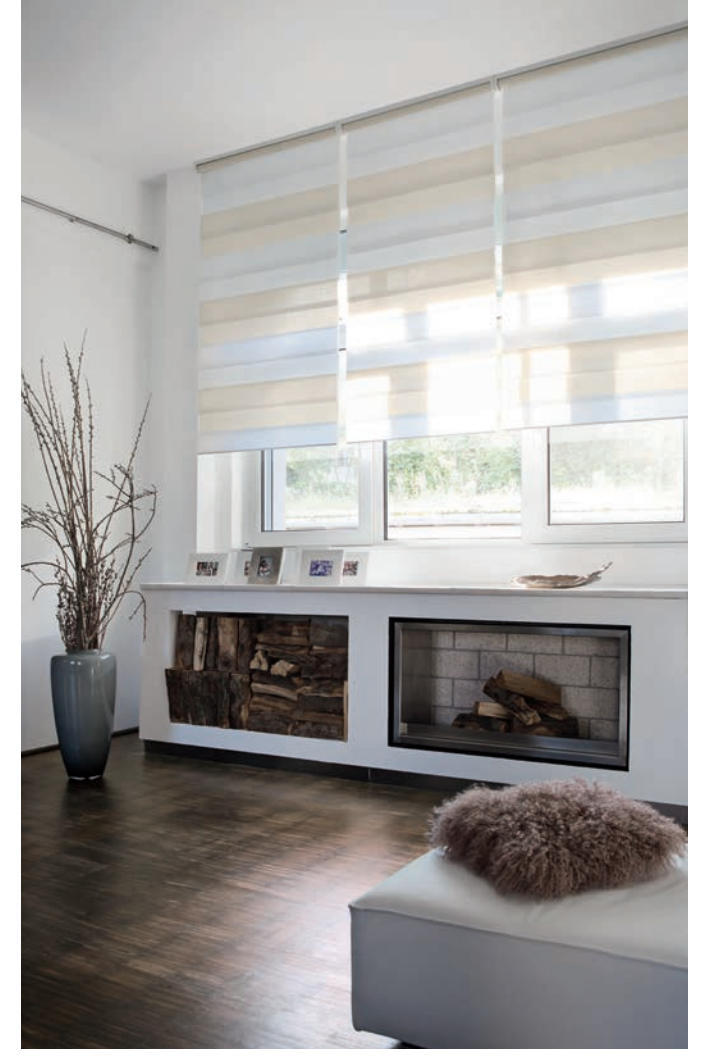
Particularly diverse: The coloured block stripes appear twice as wide when the widow is closed.

TWO DIFFERENT COLOURED BLOCK STRIPS IN THE FINYA DESIGN BREAK UP THE CLASSIC STRIP DESIGN.